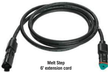
Melt Step 6' extension cord