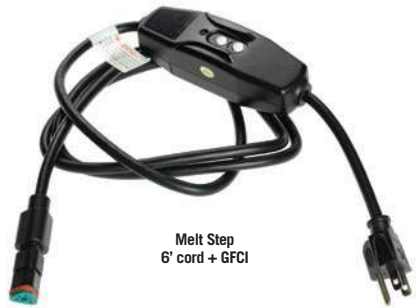
Melt Step 6' cord + GFCI