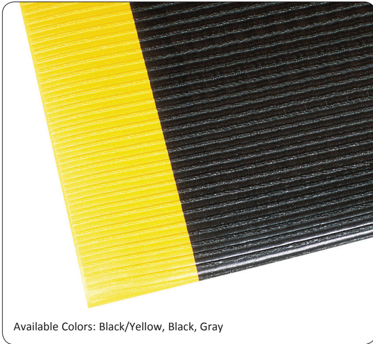
Available Colors: Black/Yellow, Black, Gray